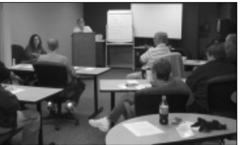
Liscomb addresses training group

Each new driver went through the new program for three weeks. The program included classroom training and testing, as well as, on the road training and instruction in ICTC vehicles. After training the new drivers, all current ICTC