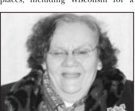
"It's a nice thing to know you've got friends. I recommend ICTC if you move to town."